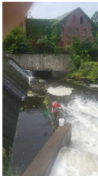
Another thing we'll be doing is monitoring dam draw-downs associated with dam removals to ensure significant numbers of fish or mussels are not stranded on exposed pond beds. Above, seasonal Zach Skelton monitors a draw down of the Somersville Pond Dam.