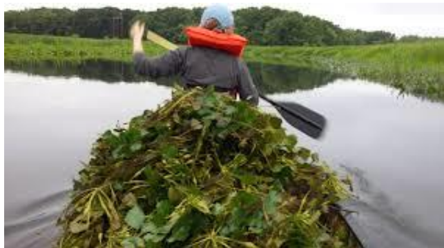
One job we'll do this summer is to assist the regional effort to eradicate stands of the evasive water chestnut from the lower Connecticut River. If you want to help, contact the Connecticut River Conservancy.

The season wrap up? Obviously we had a GREAT shad run. We were surprised that the number of Atlantic Salmon actually went up this year. While the count of Blueback Herring at Holyoke was higher than the past several years, it still was very low and observations from the lower river indicated that the numbers were low and sporadic. The Sea Lamprey run was typical for recent years but a bit low. And it's too early to say much about Shortnose Sturgeon. We'll know more by fall.